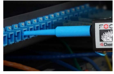
Step 4.1: Wet tip of CCT tool and clean fiber optic connectors