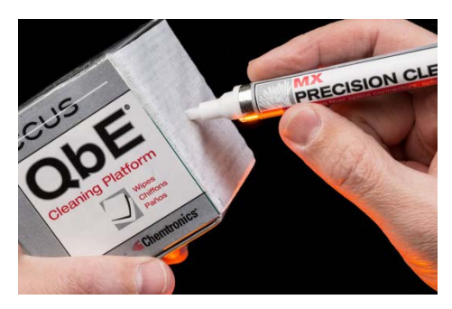
Step 5.1: Saturate wipe with Fiber-Wash MX Pen