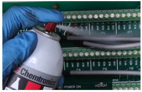
Step 2: Remove moisture with Flux-Off® Water Soluble cleaner and UltraJet® Duster