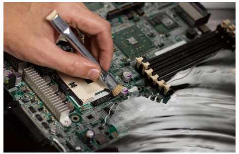
Step 1: Rinse with clean water

Cleaning and restoration of backplane connections can be effectively achieved through the use of Chemtronics' Clean Connection Tools, or with cleaning swabs designed for this purpose.