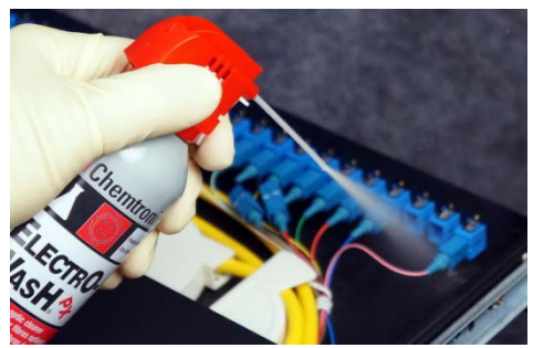
Step 3: Clean with Electro-Wash® PX